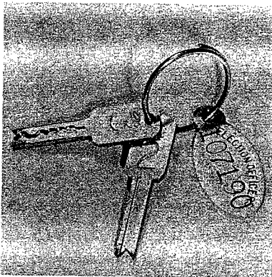
Election Officials: No. 2 Key No. 3 Key

Each key is clearly stamped with an identifying number or letter. Each complete set of keys for one machine is placed on key rings together with tags showing the serial number of the machine and indicating that the keys on that particular ring are for use by Election Officials or by the Custodian only. Each complete set of keys is placed on tagged key rings as follows: