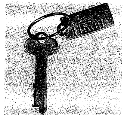
Custodian only: No. 5 Key

NOTE: (Machines used in some communities are not equipped with a No.5 Lock and this key will, of course, not be found in those communities.)